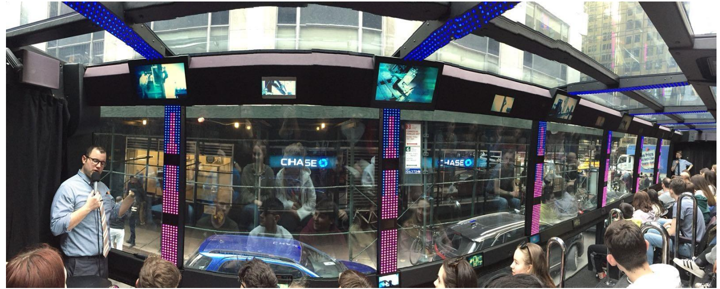
(pictured above - The Ride)