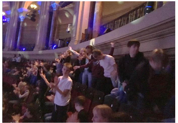
On Tuesday 1 st May around 50 children studying music visited the Royal Albert Hall for a Symphonic Rock Concert. They had an amazing time listening to music by Adele, U2, Rolling Stones, George Michael, The Kinks, Michael Jackson, Survivor, Meat Loaf, Bonjovi and Queen performed by the Royal Philharmonic Orchestra.