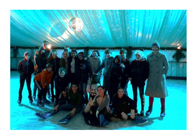
8CHN Ice skating at Tulleys Farm