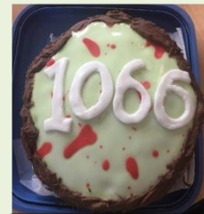
Lois Humphreys 7RBA