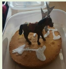
Poppy Macpherson 7KRO