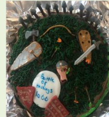
Freddie Wakeford 7RCR