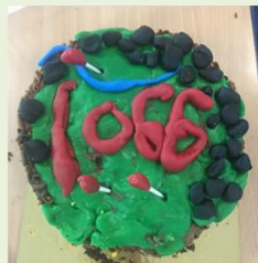
Dylan Khumalo 7RBA