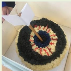
Sophie Kitchen 7SLR