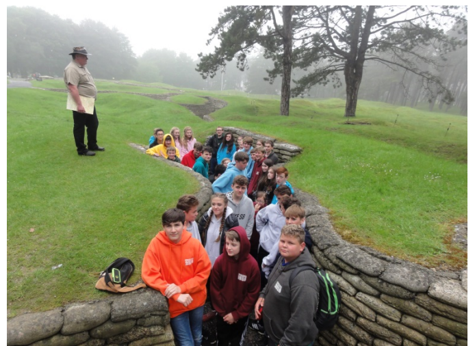
In the trenches near Vimy Ridge