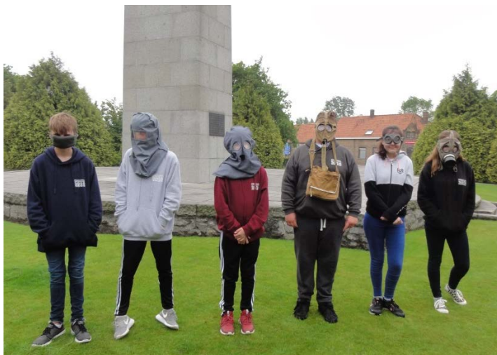
(Gas masks at the site of the first gas attacks near Ypres)