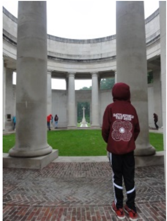
(Contemplating the missing at Ploegsteert Memorial)

On the third and final day we visited Tyne Cot – the biggest Commonwealth War Grave in the world. Over 70,000 graves and over 100,000 names listed of all those who fought – New Zealanders, Australians, Scottish, Welsh along with two German graves. In the centre of the cemetery was the Cross of Sacrifice. Late that evening we travelled back from France to Reigate School after a very memorable trip.