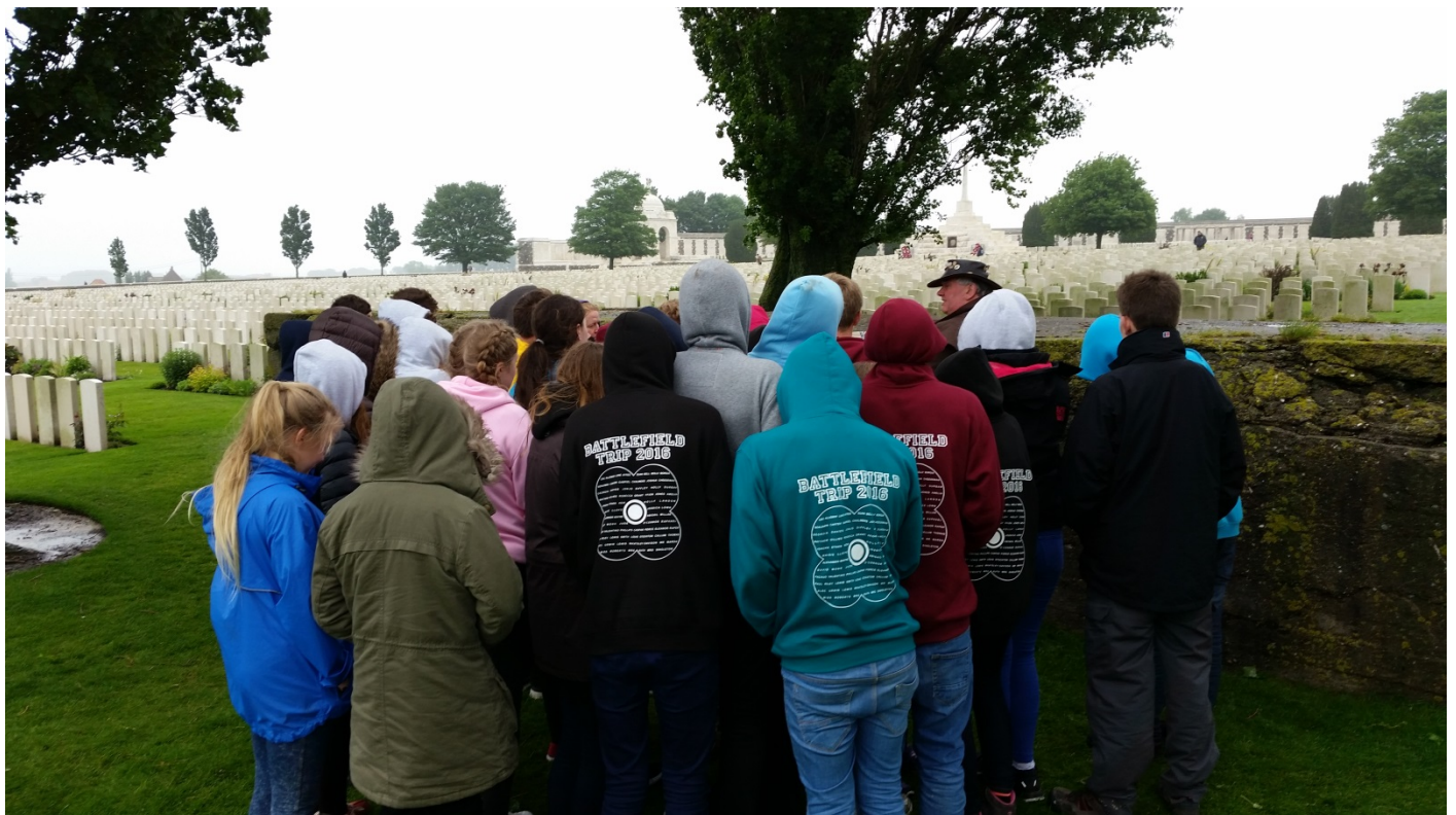
(Tyne Cot Cemetery)

On the third and final day we visited Tyne Cot – the biggest Commonwealth War Grave in the world. Over 70,000 graves and over 100,000 names listed of all those who fought – New Zealanders, Australians, Scottish, Welsh along with two German graves. In the centre of the cemetery was the Cross of Sacrifice. Late that evening we travelled back from France to Reigate School after a very memorable trip.