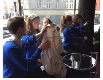
Perhaps one of these might be the next Bishop?

The latest recruits to play Jean Valjean and Thenardier