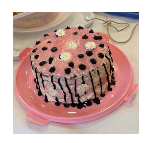
Zuzanna Skiba 7SCA