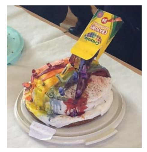
Eliza Siddiqui 7JKE