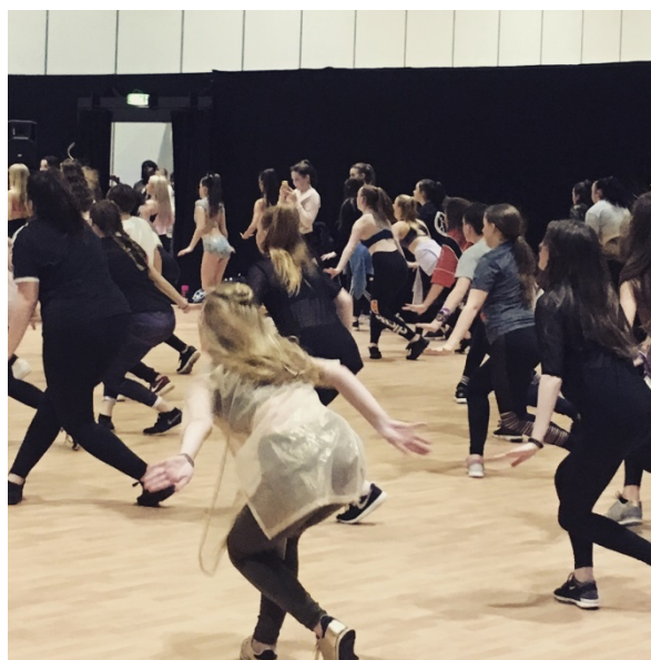
Commercial for TV and Catwalk

Our Reigate School dancers took part in three different classes and came away feeling really inspired. Between them they tried out Irish Dancing, Jamaican Dancehall, Hip Hop, Ballet, Lindyhop, Bollywood and everything in between. They gave everything their best go and generally came away feeling really motivated and excited about all they had learnt.