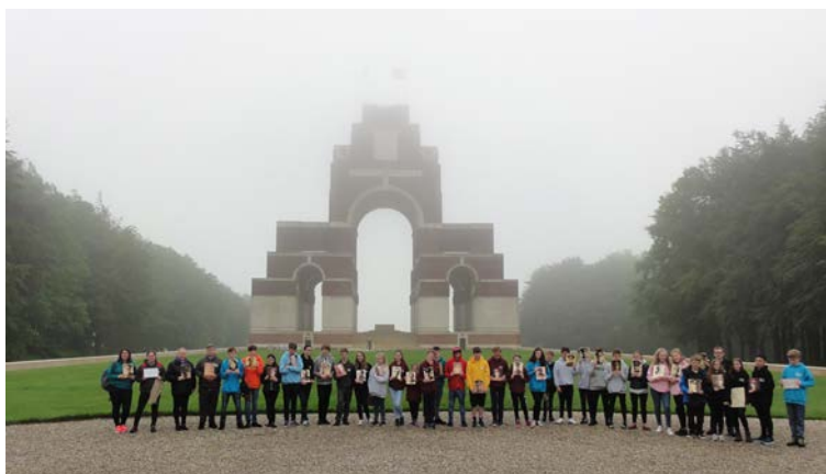
(A picture from last year's trip)