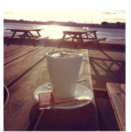
Himali Mendis 9BPO