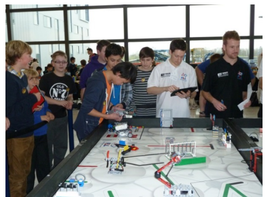
Our Young Engineers ready for the competition.