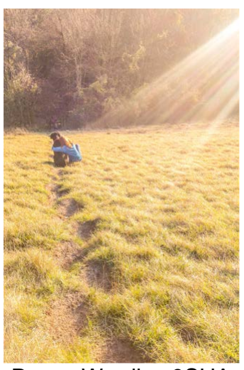
Poppy Wardley 9SHA