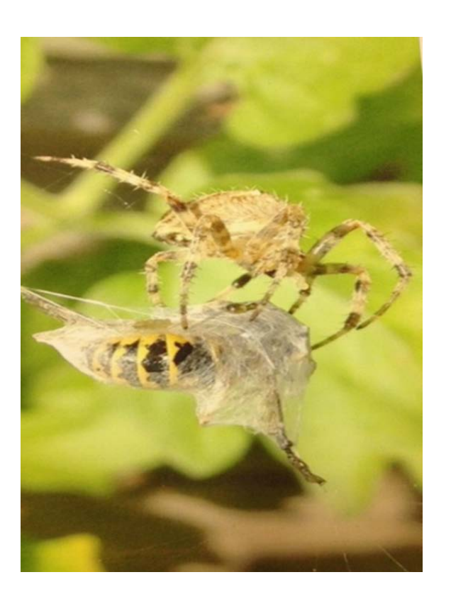
3rd Eva Hill (9CHA)

'This is a well composed photograph, the branches frame the scene beautifully. The use of effect and manipulation have been skilfully applied to create this sensitive and atmospheric scene'.