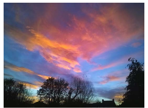
Paige Cawtheray 9CHA