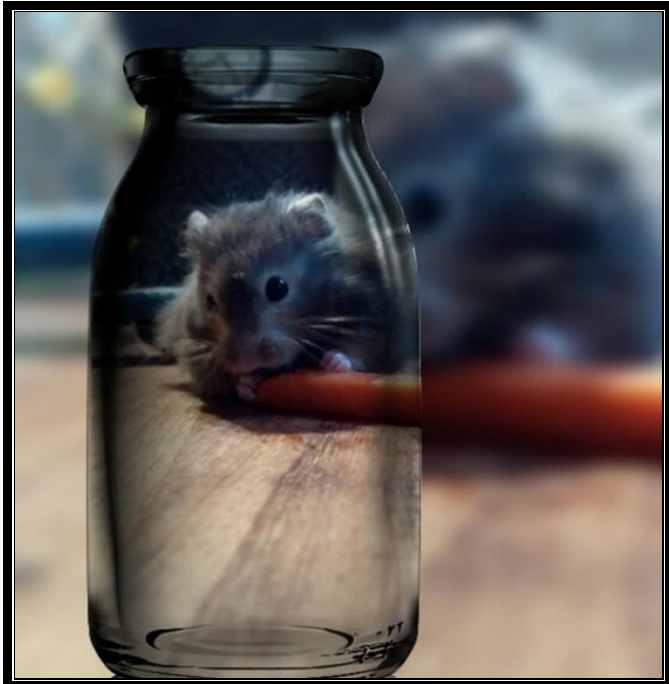
2 nd Place Emily Hill