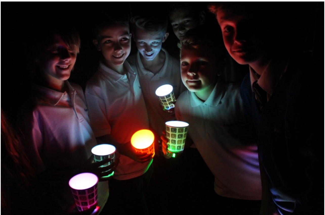
Students at the LED light drawing workshop

I really liked the Planaterium and indoor fireworks because it was different and I had never seen it before. I liked the planaterium because it was good to see it in person and not just read about it. I liked eagle heights because the birds were cute and I liked being up close to them. Reported by Sofia Yermo.