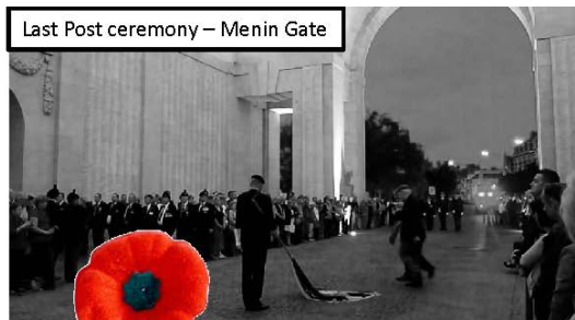
Last Post ceremony – Menin Gate

It is 100 years since the World War I. Come and join us on this exciting trip to visit important sites of the Somme and Ypres, including attending the Last Post Ceremony at the Menin Gate and visiting the underground tunnels in Arras where the Allies sheltered from the bombardments. Experience the historical sites and visit the places where men gave up their lives for our freedom.