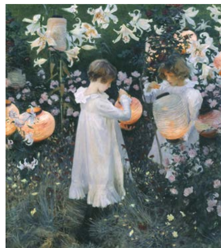
Carnation, Lily, Lily, Rose by John Singer Sargent