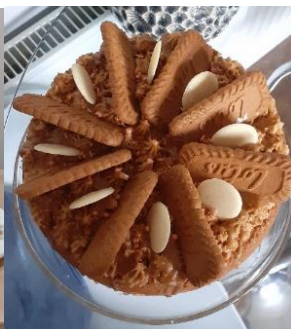
Amelie Seldon (Yr 7)