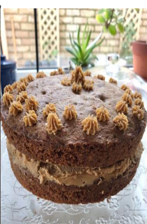
Sienna Rogers (Yr 9)