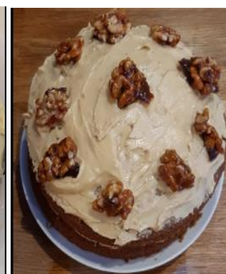
Amy Hedges (Yr 8)