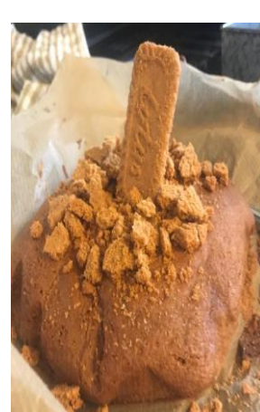
Lana Seager (Yr 7)