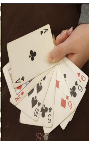
Laurel Regnard (Yr 7)