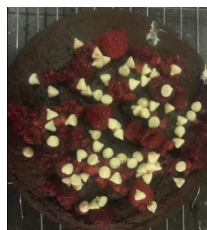
Daisy Arnell (Yr 7)