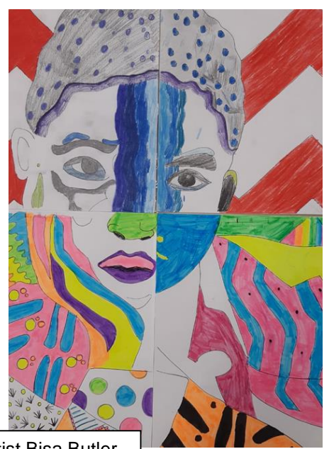
The finished pieces from Year 7 Art lessons inspired by artist Bisa Butler.