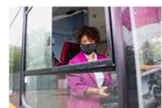
Public transport workers