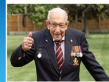
Captain Sir Tom Moore