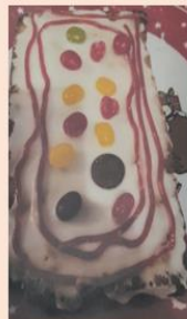
Make a cake!