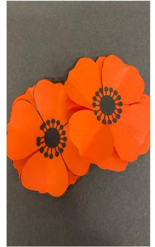
Poppies made using the laser cutter in DT.