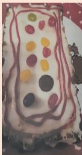
Make a cake!