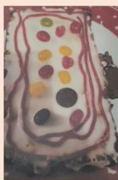
Make a cake!